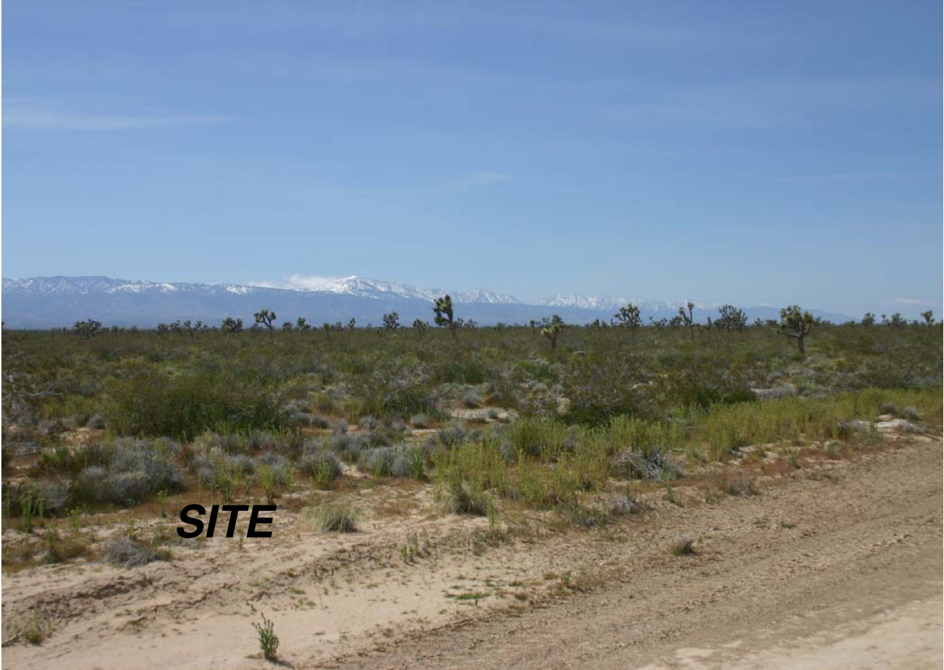
Looking Southwest from Bartlett Ave.