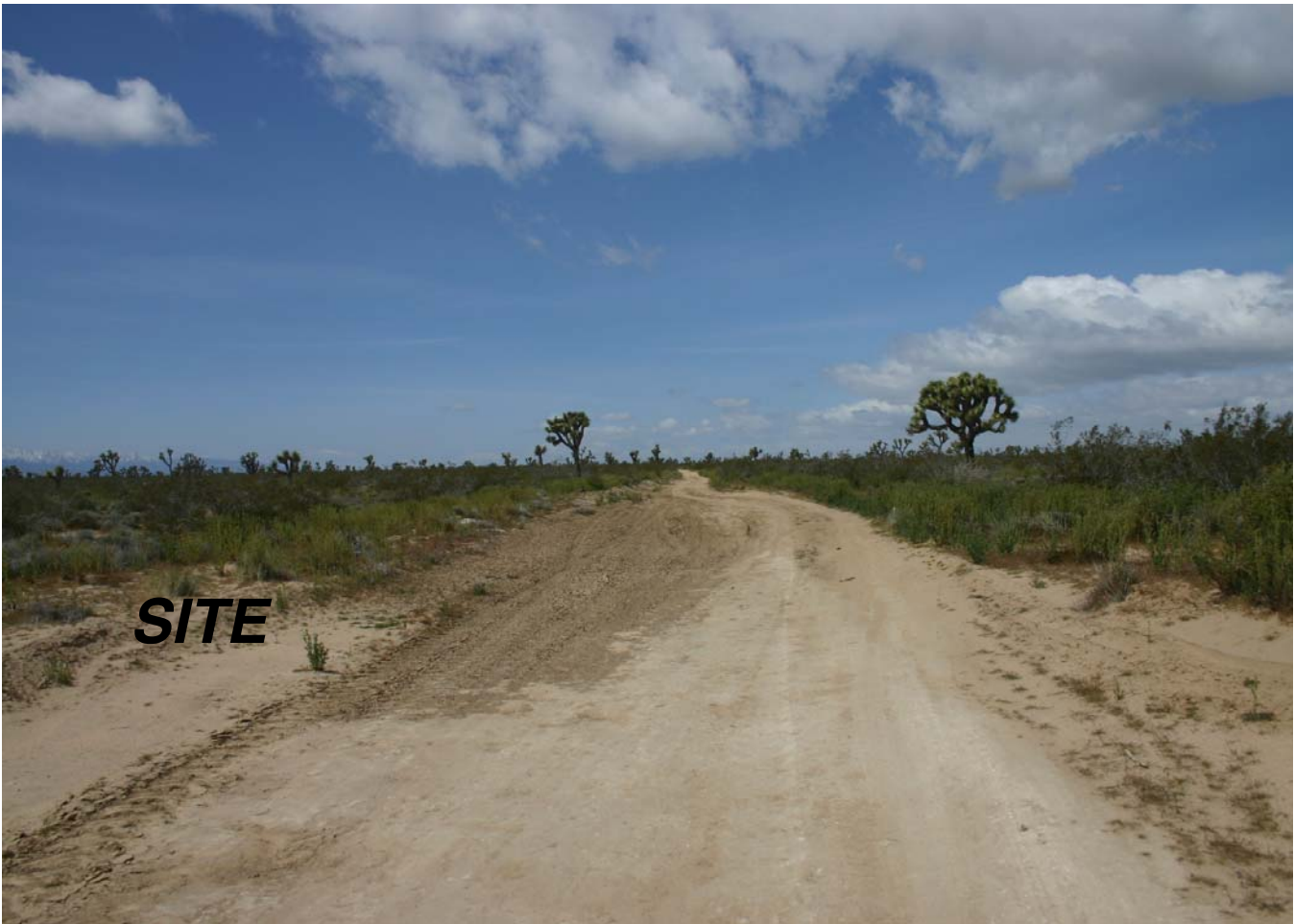
Looking West on Bartlett Ave.