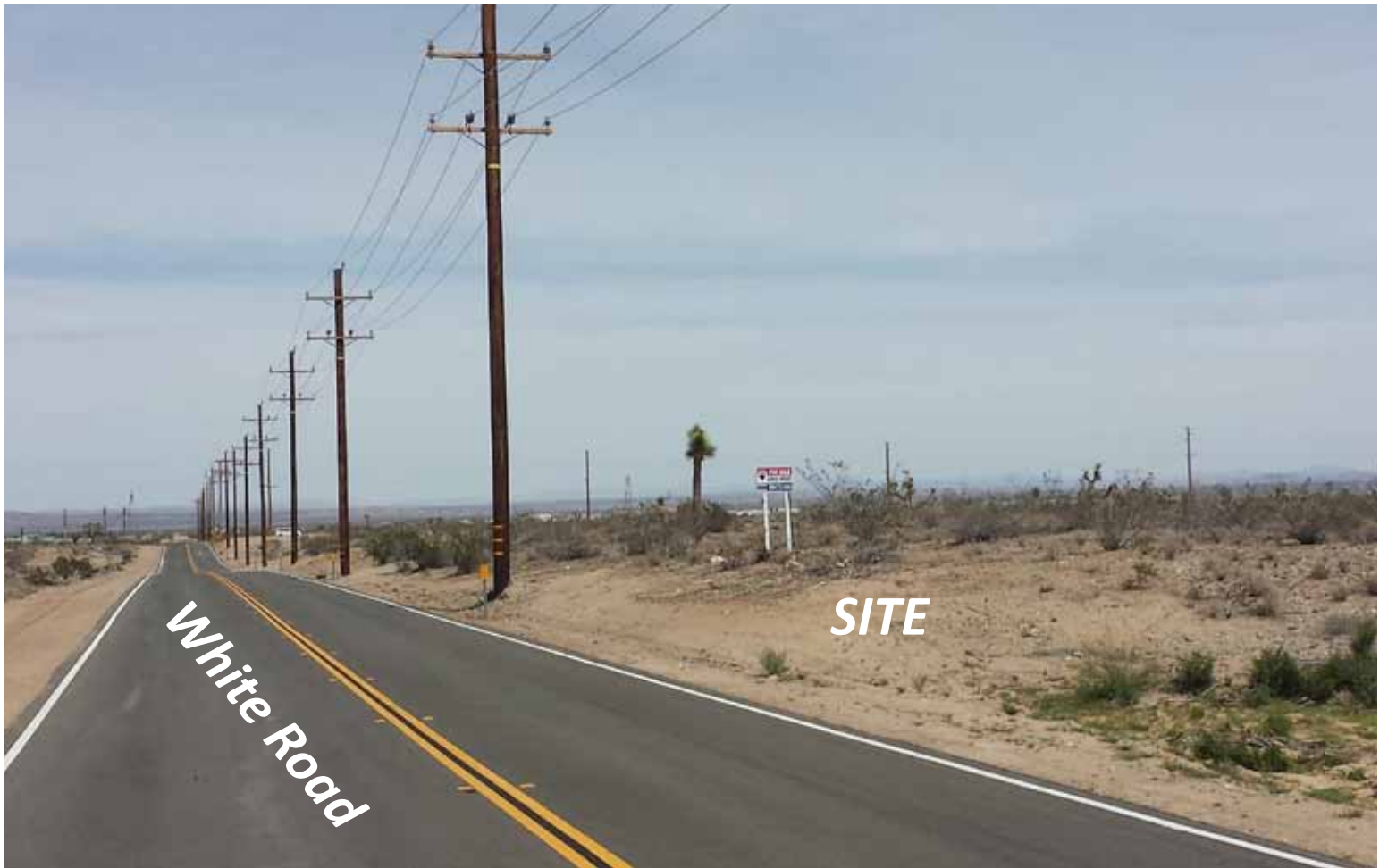
Looking North to Palmdale Road