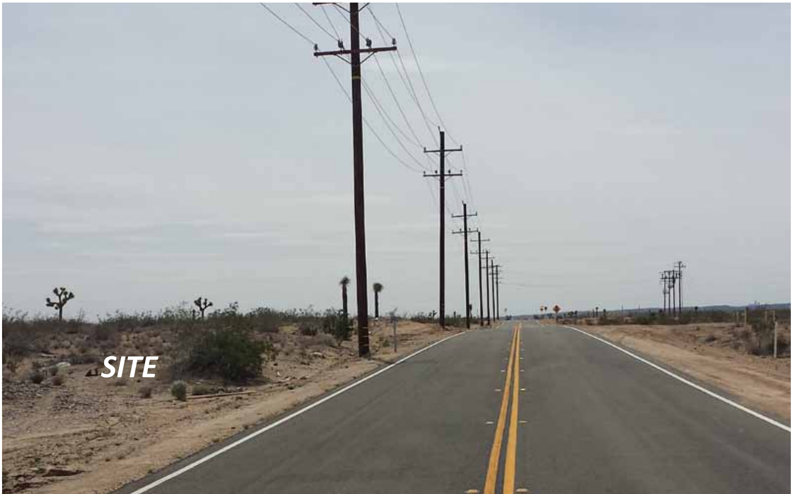
Looking South on White Road